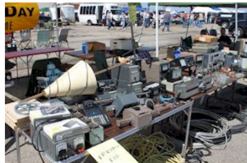
Everything you want in classy, retro - radio!

A most important part of the DELARA booth is the seating! Always a great place in the shade!