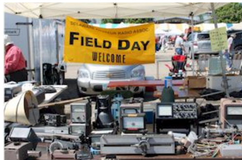
C'mon! Buy a trasure!