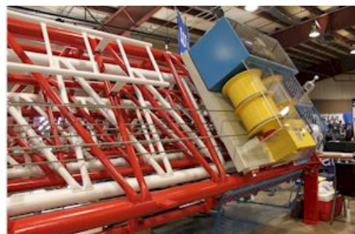
Now THAT'S a crank-up!